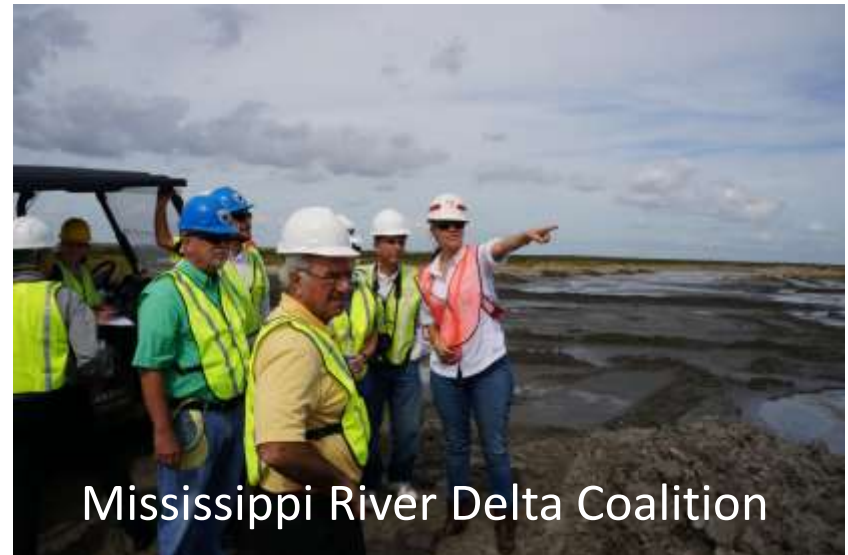
Mississippi River Delta Coalition