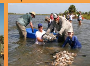
Figure 6. Reef Construction (Galveston Bay Foundation).