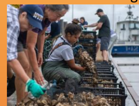
Figure 4. Volunteer Event (Billion Oyster Project).

Major goals of this project is to discover and share best practices for oyster shell recycling in order to optimize existing and new programs, and to open lines of communication with even more programs. Therefore, CRCL will be collaborating with Restore America's Estuaries to host an OSRP Panel at 2021 Living Shorelines Tech Transfer Workshop.