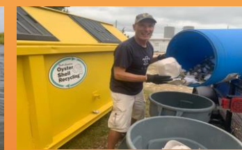
Figure 7. Public Drop off (North Carolina Coastal Federation).