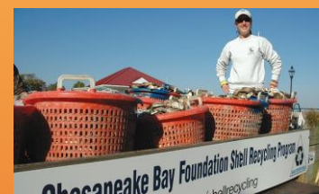
Figure 5. Shell Collection (Chesapeake Bay Foundation).