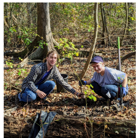
Volunteers planting native species. Woodlands Conservancy

What started as a National Estuaries Week program evolved in 2019 to encompass volunteer restoration projects throughout the fall planting season. Funding provided by CITGO enabled the reimagined Caring for Our Coasts Gulf Region Grants Program . Grants provided the opportunity for high school students in Alabama to learn about salt marsh habitats and participate in native plantings, while in Louisiana, community members were offered the chance to join interpretive trail hikes before participating in invasive tree removal. The true value of this program is seen not only through direct conservation impacts, but also through the local engagement by Gulf Coast communities. By creating environmental stewards, we are securing a healthy future for these habitats and their surrounding region well into the future.