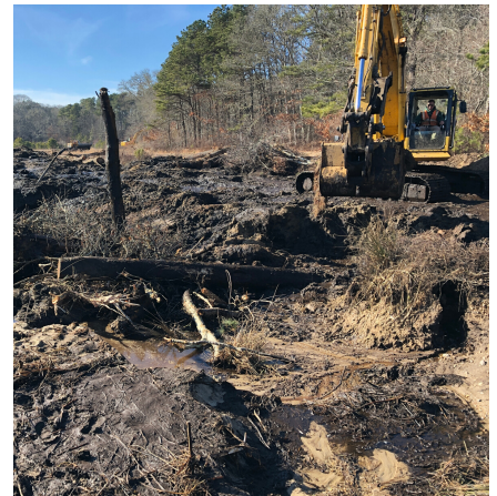
Cranberry bog restoration. Inter-fluve.

In 2018 and 2019, the U.S. EPA Southeast New England Program (SNEP) Watershed Grants , a program administered by RAE, awarded more than $6.5 million in grants to 25 partnerships throughout Rhode Island and Southeast Massachusetts, funding a diversity of important projects. In Narragansett Bay, funding supports a network of real-time water quality monitoring buoys; in Falmouth, MA, an innovative project to return abandoned cranberry bogs to natural wetlands and streams; and on Martha's Vineyard, cutting-edge technology to reduce pollution from groundwater before it enters coastal waters. With continued support from the U.S. EPA, RAE will guide millions more in federal investments in 2020 and 2021, helping these communities tackle pressing coastal challenges.