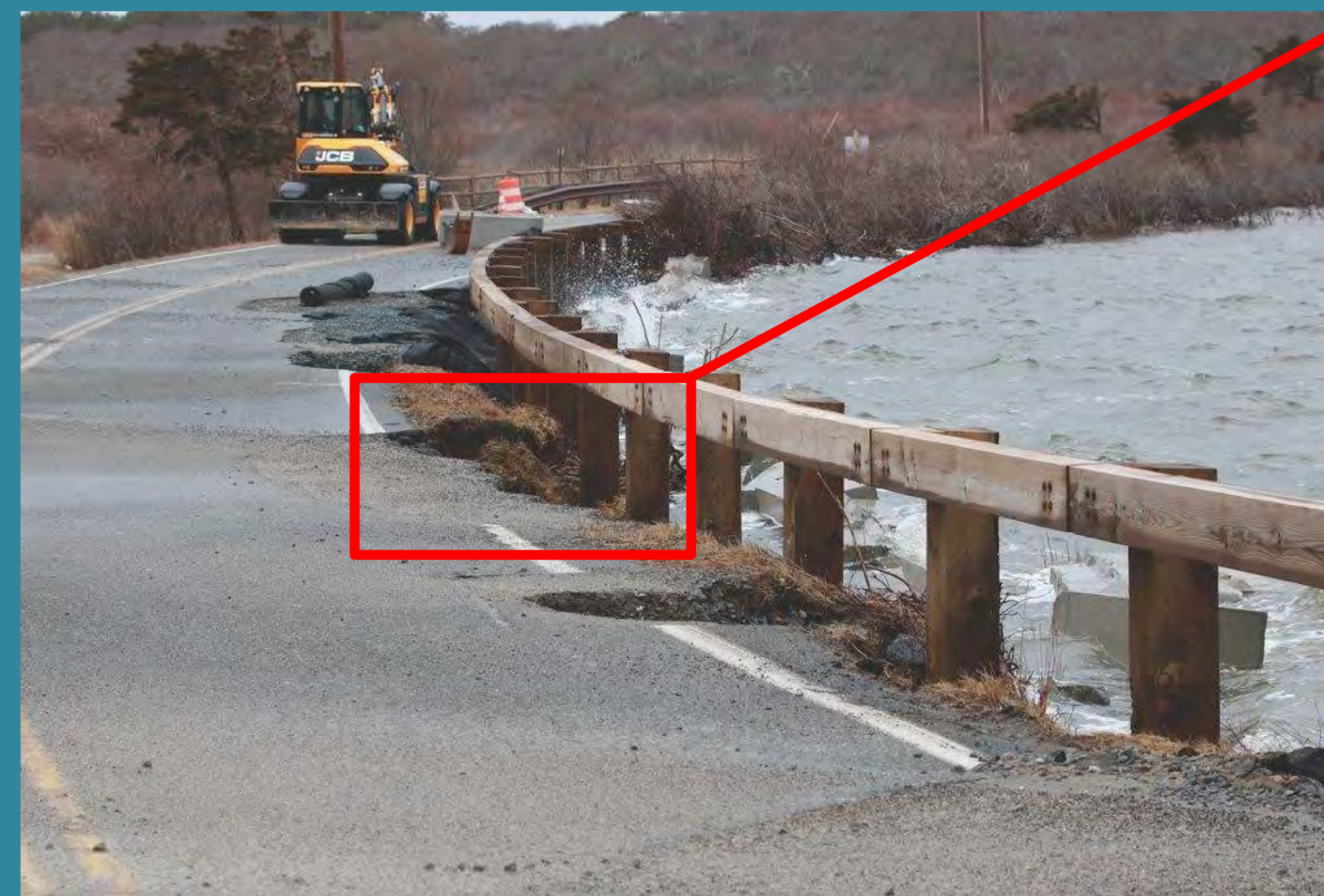
Figure 2. Polpis Road failure from a winter storm in 2018.