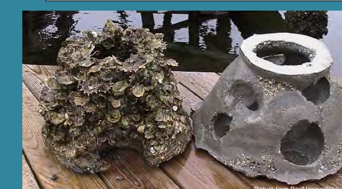
Figure 4. Reef balls serve as excellent habitat for oysters.