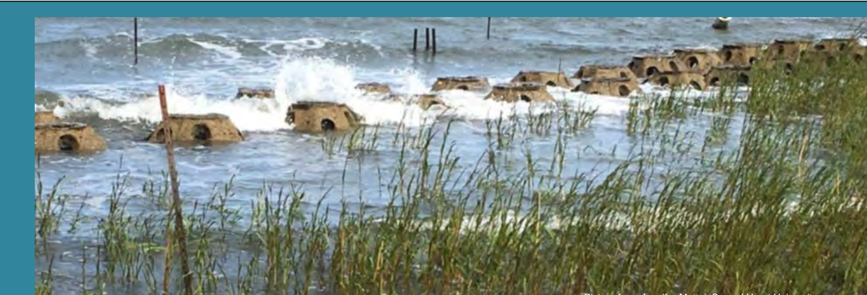
Figure 5. Reef balls promoting marsh growth at Stratford Point, CT.