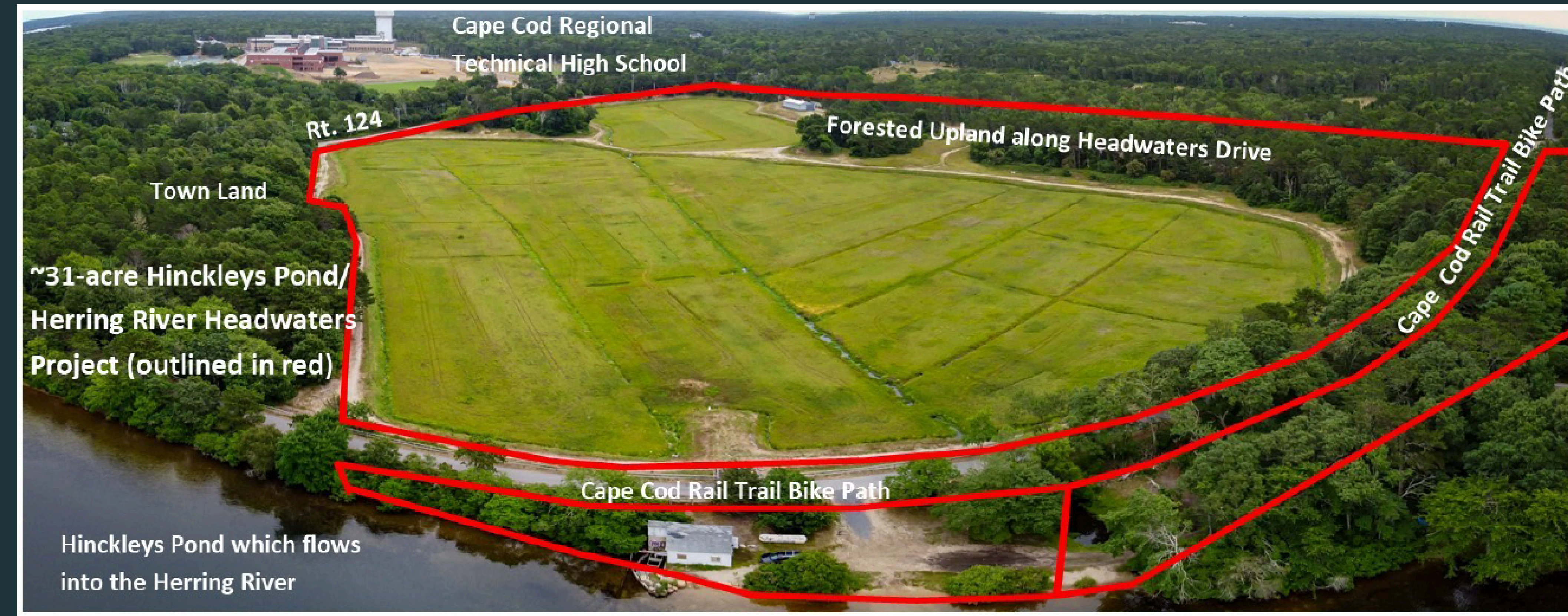
Aerial map of 31-acre project (Jenkins property)