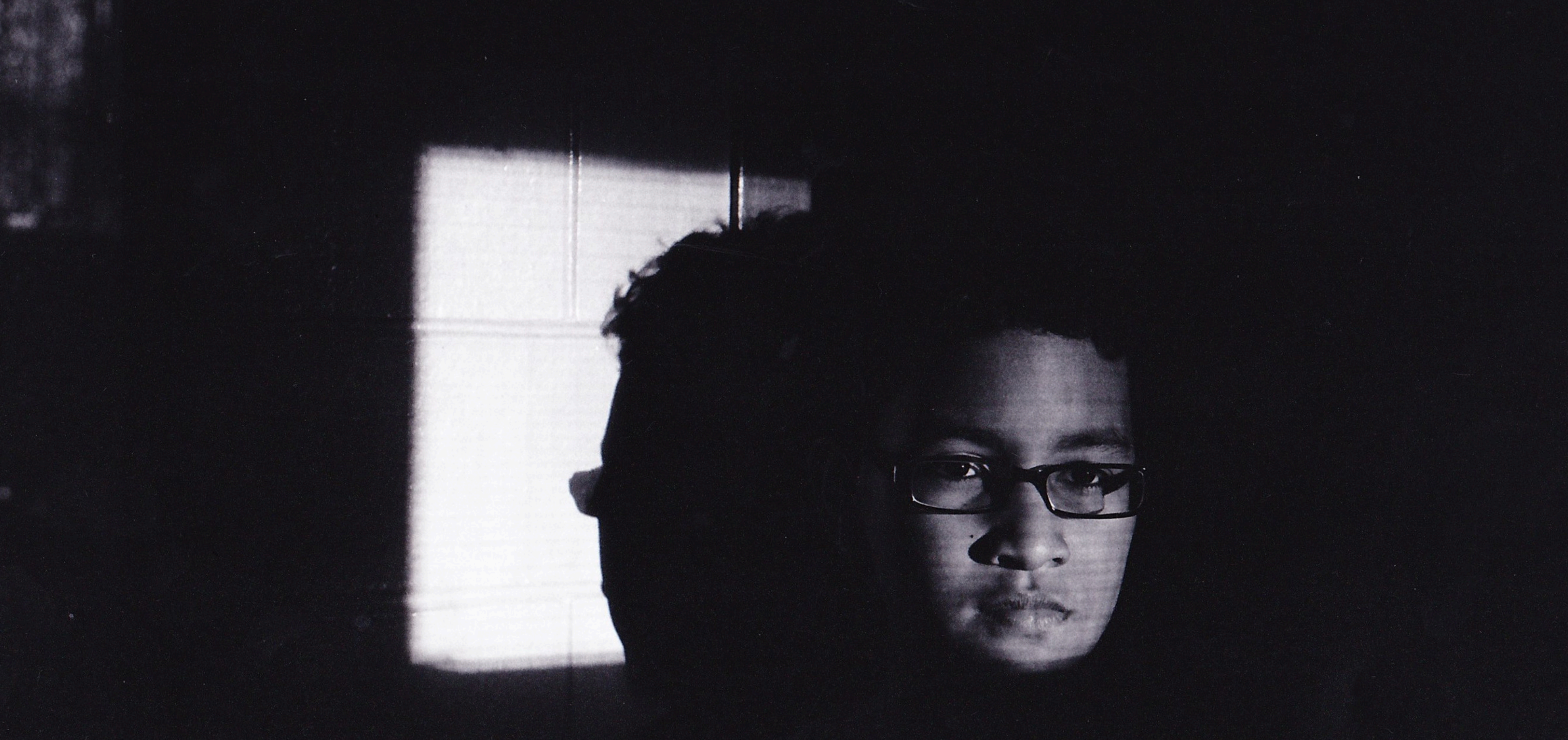
2014/2015 - Gowanus Houses Apartment Hallway