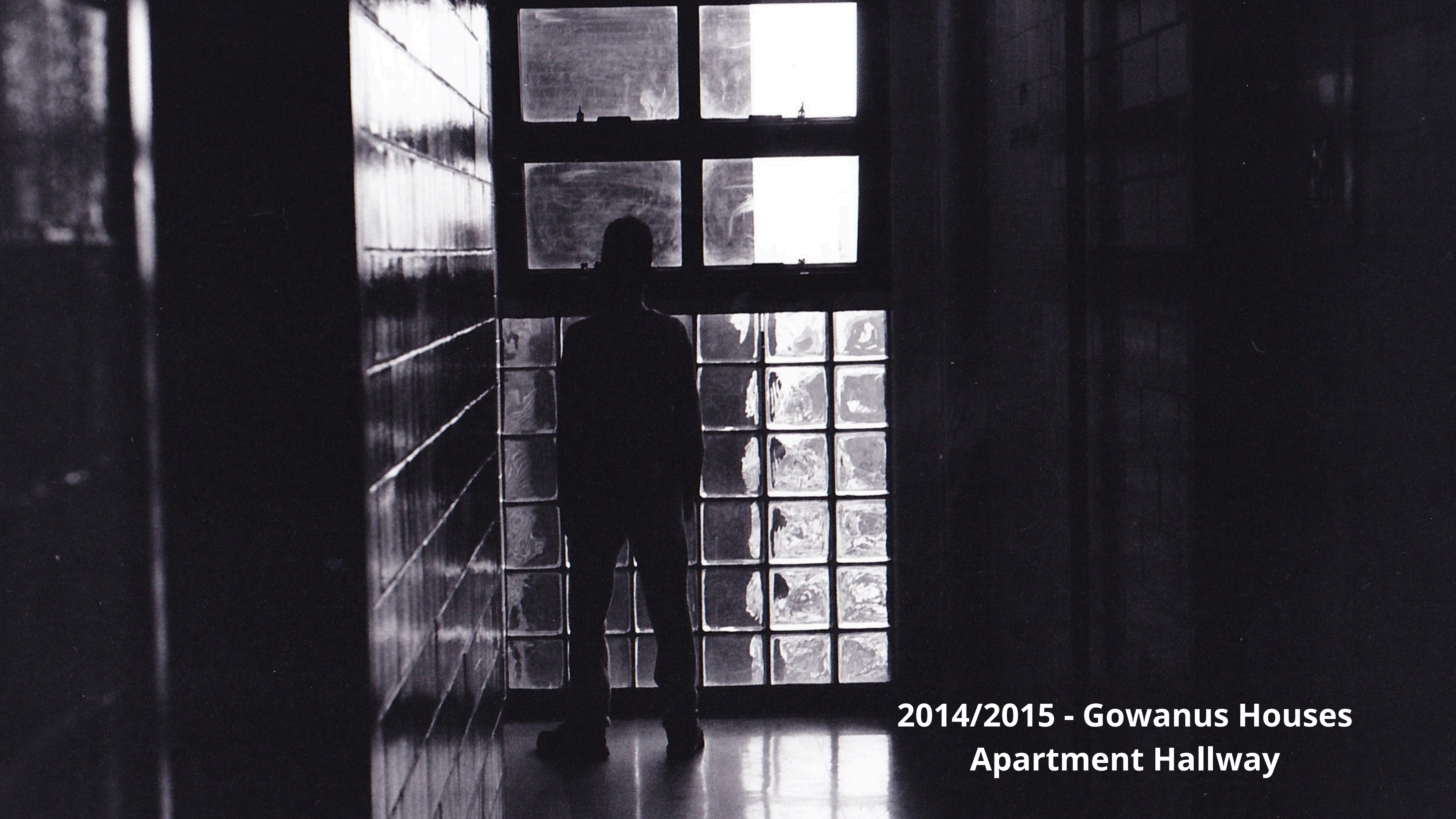
2014/2015 - Gowanus Houses Apartment Hallway