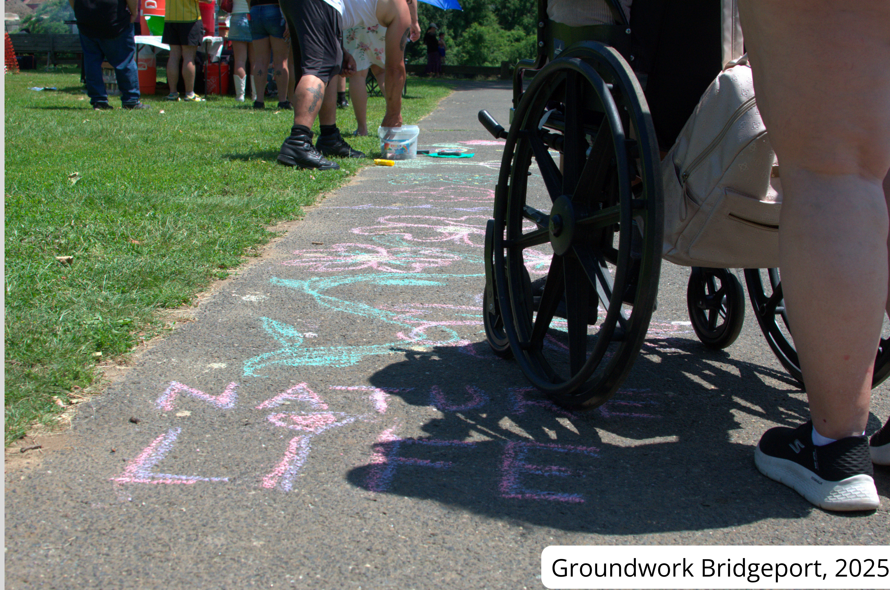
Groundwork Bridgeport, 2025