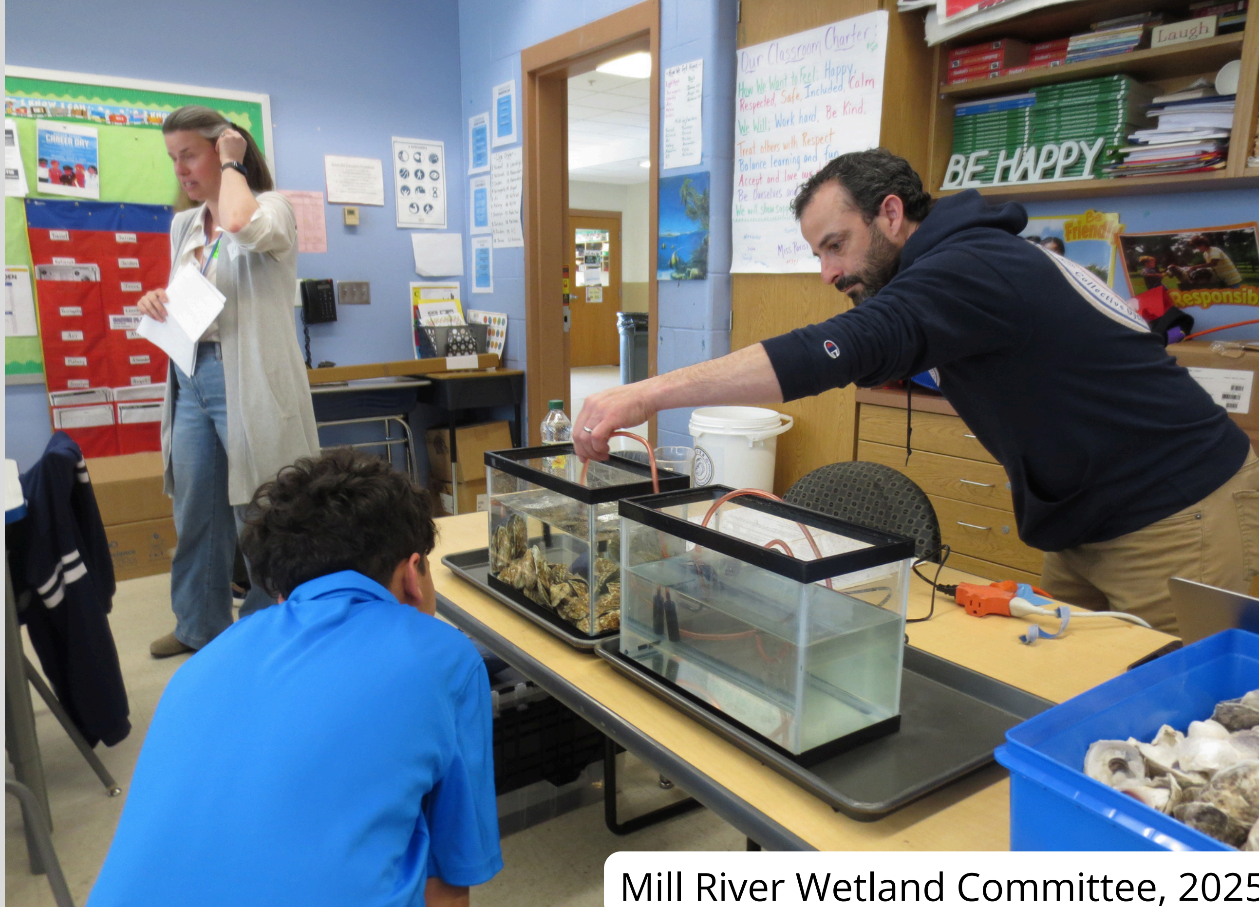
Mill River Wetland Committee, 2025

• What stands out to you? What do you see?