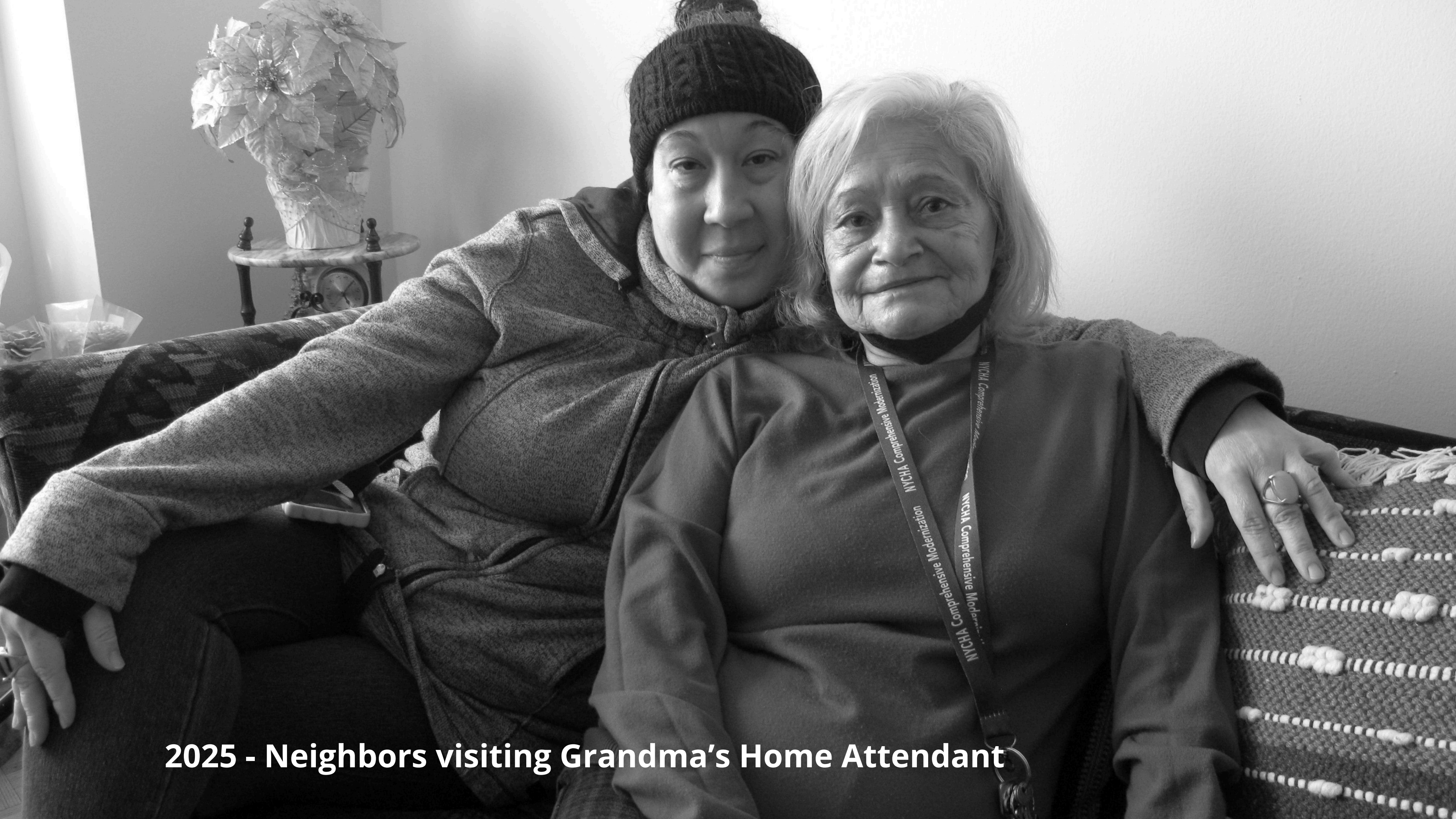
2025 - Neighbors visiting Grandma's Home Attendant