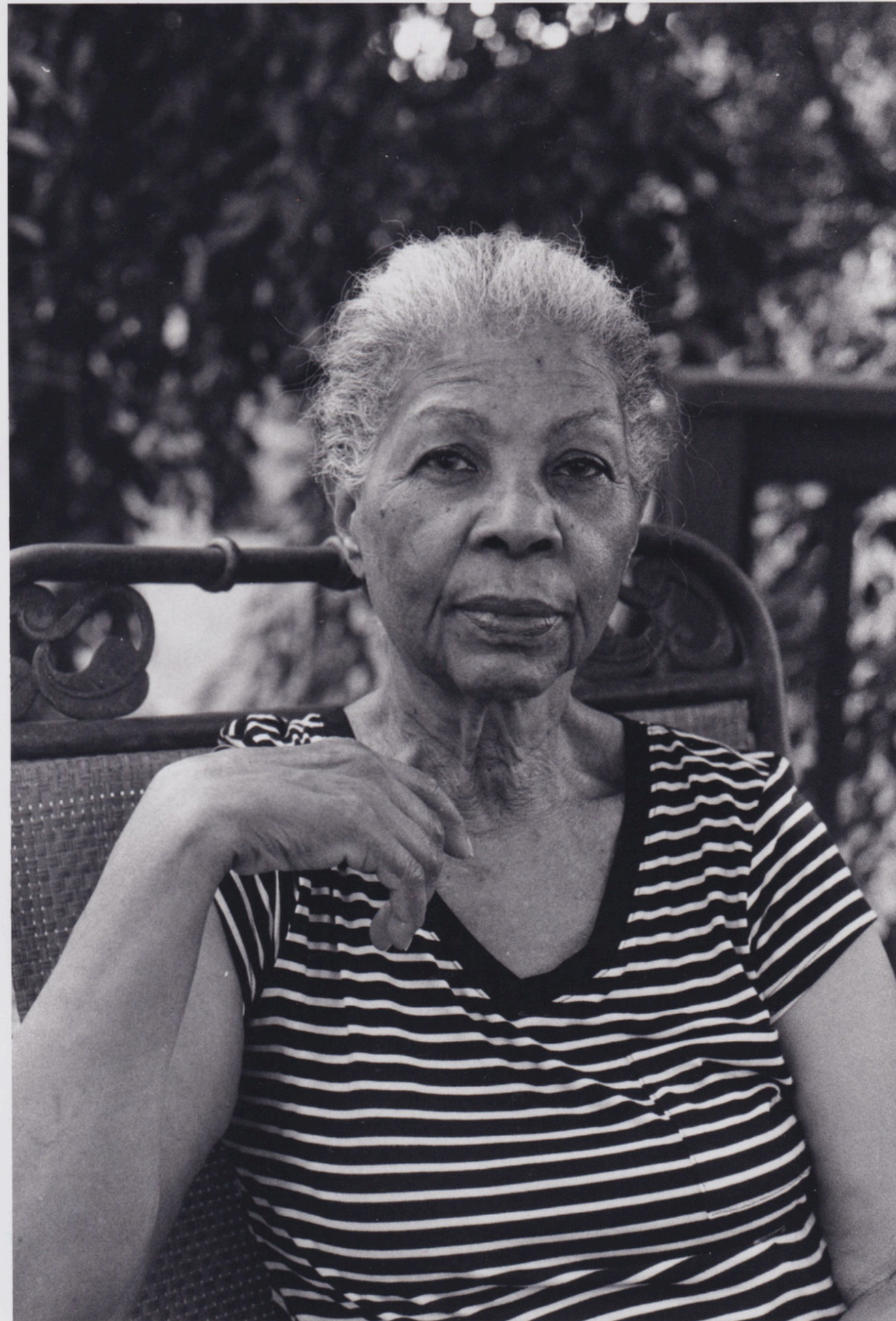
2022/23 - Grandma