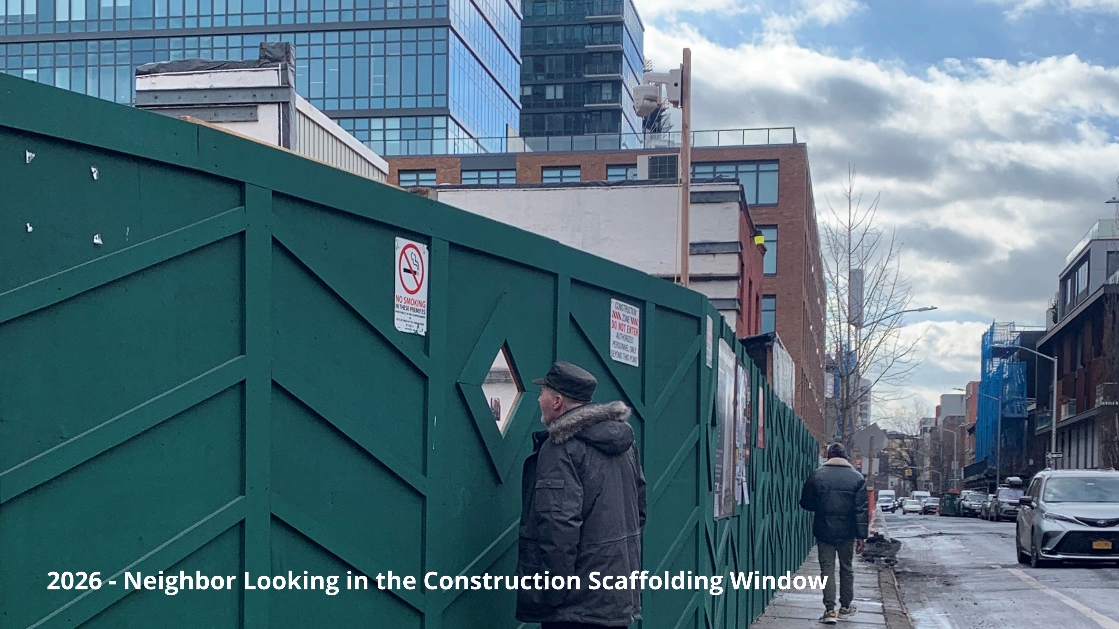
2026 - Neighbor Looking in the Construction Scaffolding Window