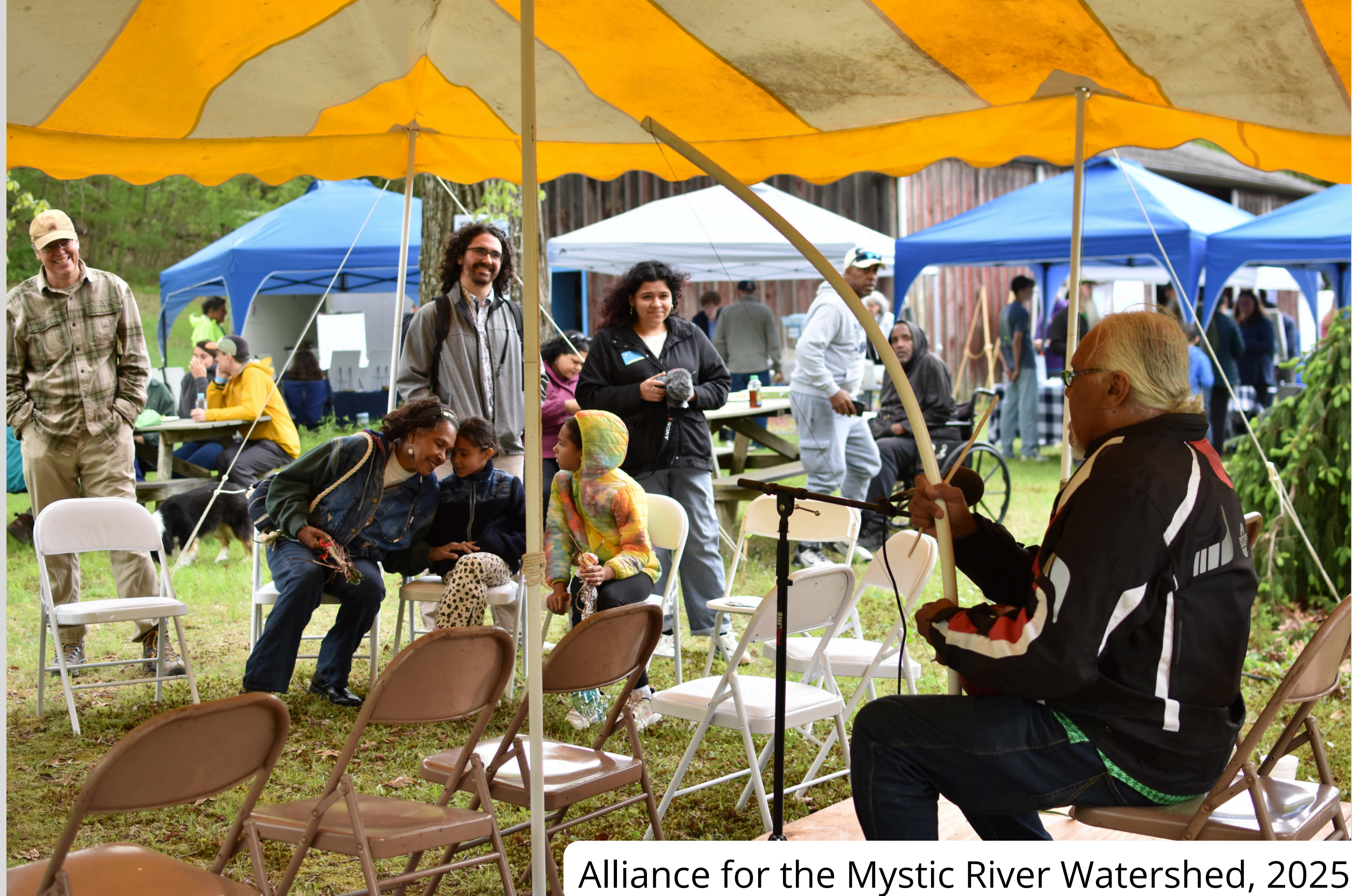
Alliance for the Mystic River Watershed, 2025