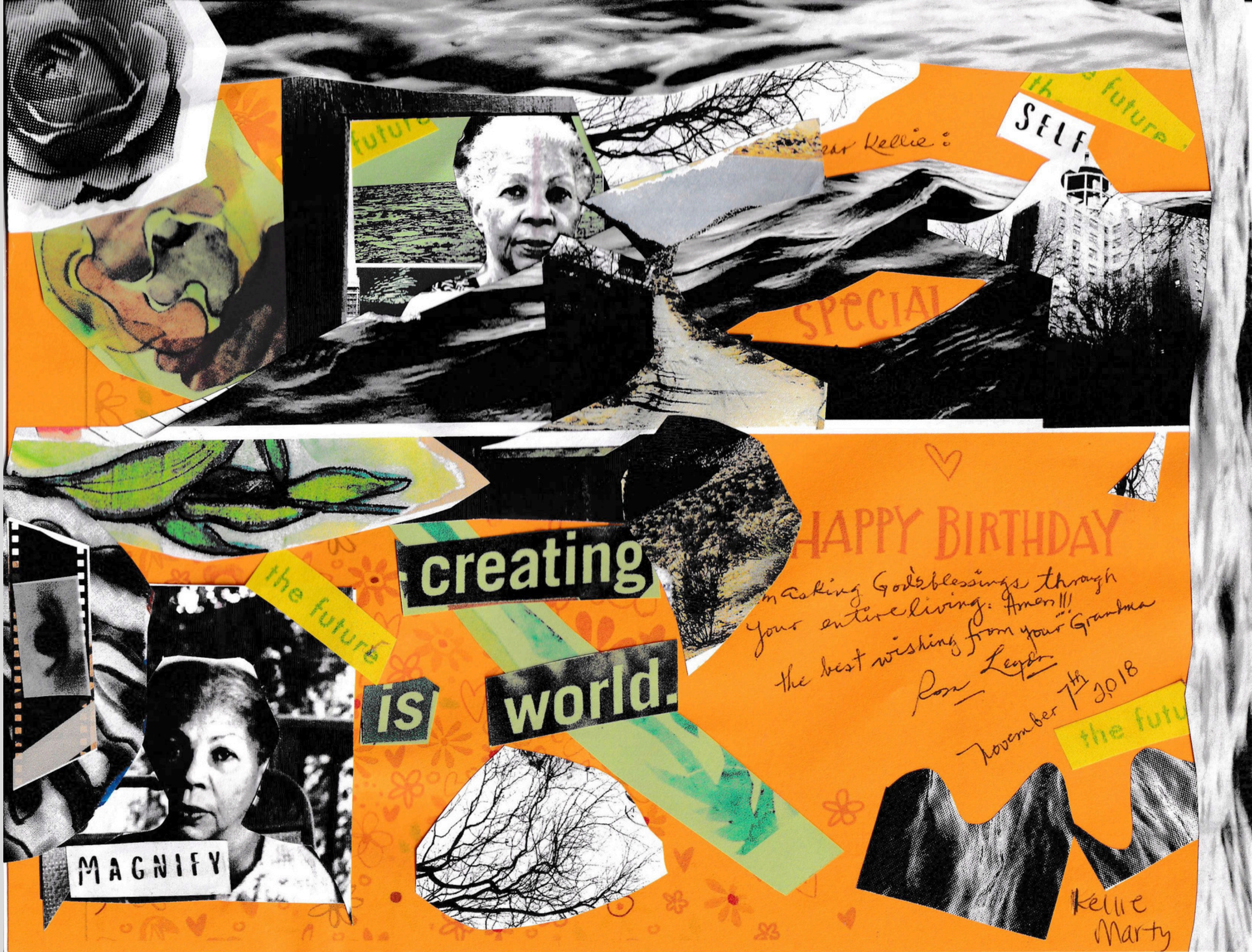
Grandma in the Gowanus Canal - 2025 Zine