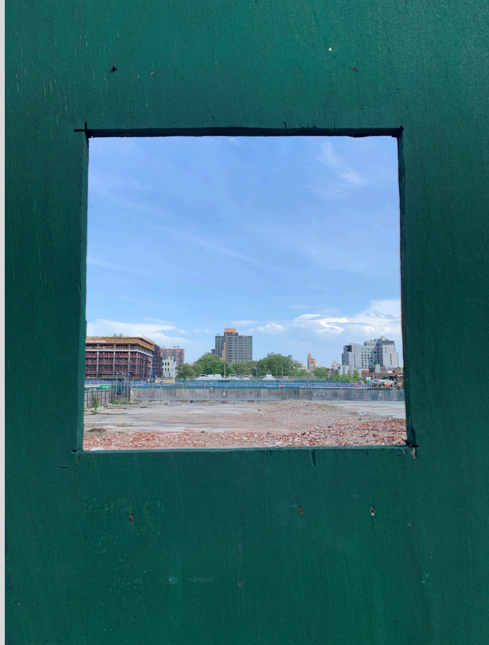
2025 - Looking in the Construction Scaffolding Window