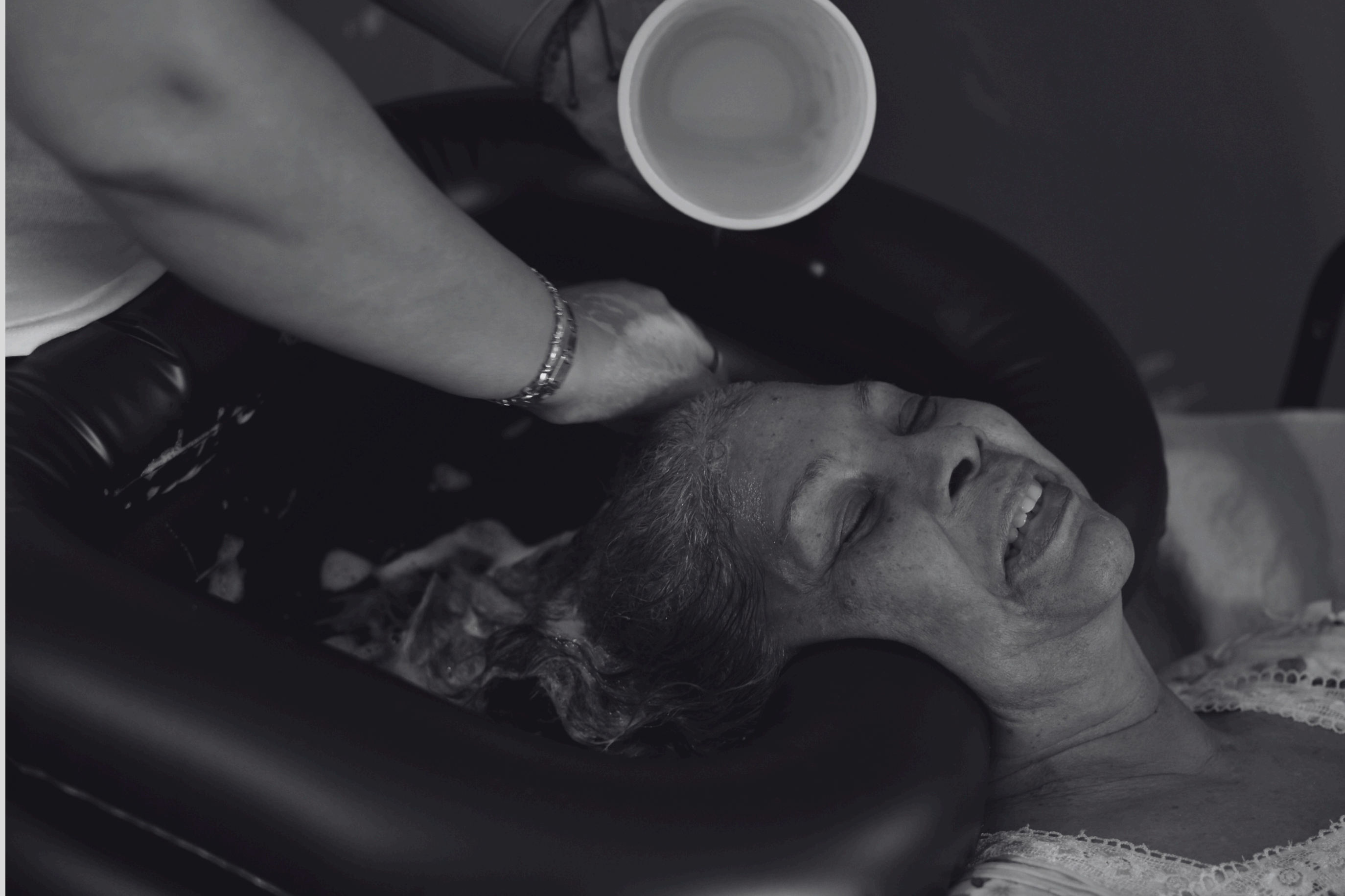
2025 - Grandma at the Gowanus Houses Apartment