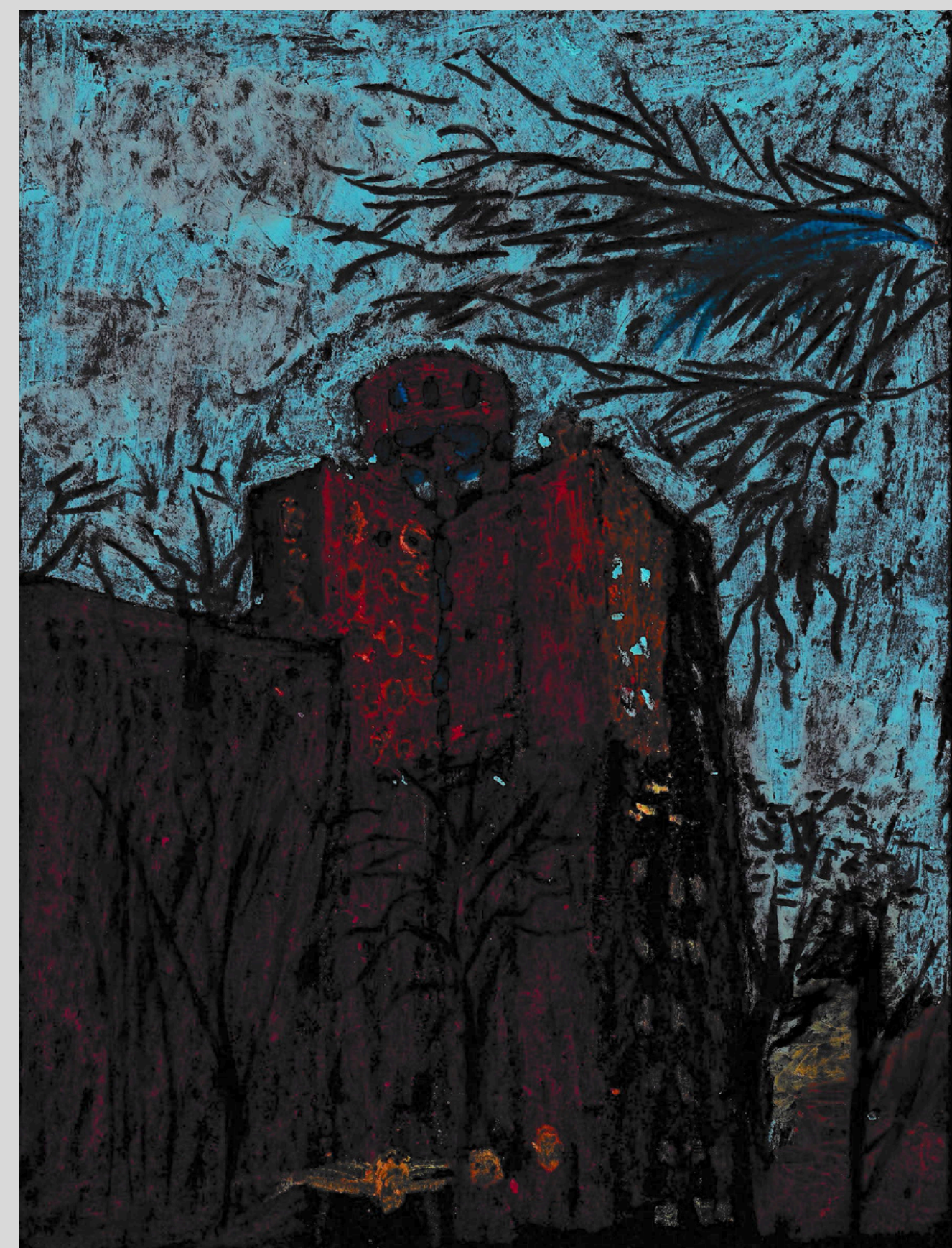
2025 and 2026 - Image and oil pastel depictions of the Gowanus Houses Projects